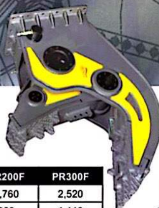
Pin on Type Mounting (P)